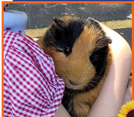
A pet Guinea Pig