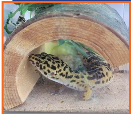
A pet Gecko